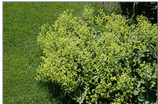
Lady's Mantle in bloom