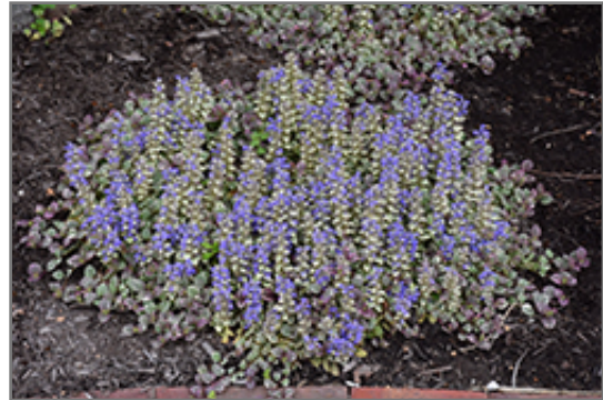
Burgundy Glow Bugleweed in bloom