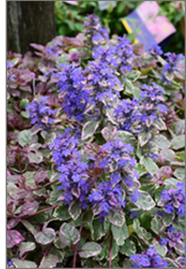
Burgundy Glow Bugleweed flowers

Burgundy Glow Bugleweed is a dense herbaceous evergreen perennial with a ground-hugging habit of growth. Its medium texture blends into the garden, but can always be balanced by a couple of finer or coarser plants for an effective composition.