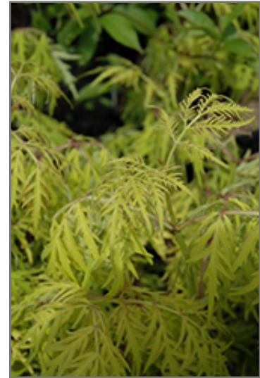
Lemony Lace Elder foliage

Lemony Lace Elder is recommended for the following landscape applications;