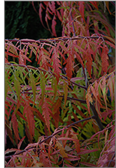
Tiger Eyes Sumac in fall

This shrub does best in full sun to partial shade. It does best in average to evenly moist conditions, but will not tolerate standing water. It is not particular as to soil type or pH. It is highly tolerant of urban pollution and will even thrive in inner city environments. This is a selection of a native North American species.