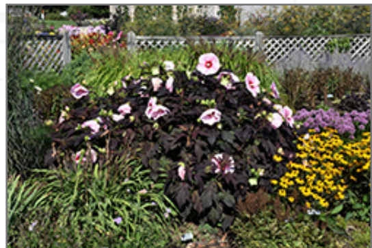
Starry Starry Night Hibiscus in bloom