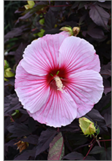
Starry Starry Night Hibiscus flowers

Starry Starry Night Hibiscus is an herbaceous perennial with an upright spreading habit of growth. Its relatively coarse texture can be used to stand it apart from other garden plants with finer foliage.