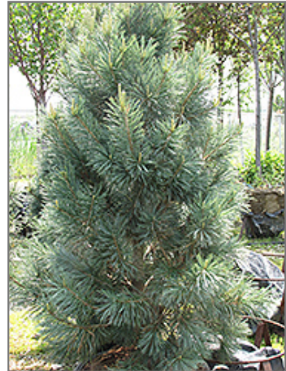
Vanderwolf's Pyramid Pine