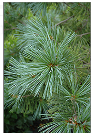
Vanderwolf's Pyramid Pine foliage