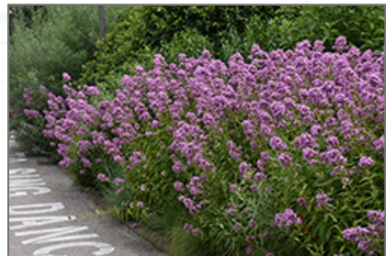
Jeana Garden Phlox in bloom