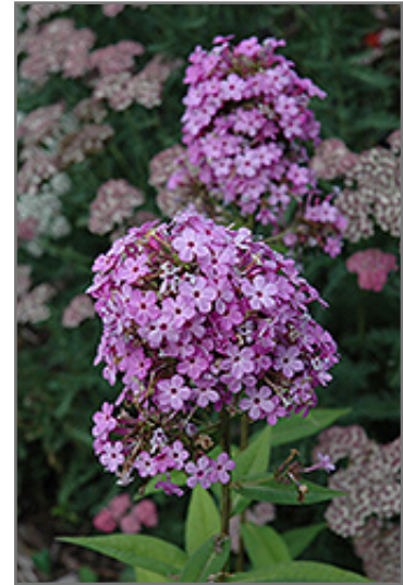
Jeana Garden Phlox flowers

Jeana Garden Phlox is a dense herbaceous perennial with an upright spreading habit of growth. Its medium texture blends into the garden, but can always be balanced by a couple of finer or coarser plants for an effective composition.