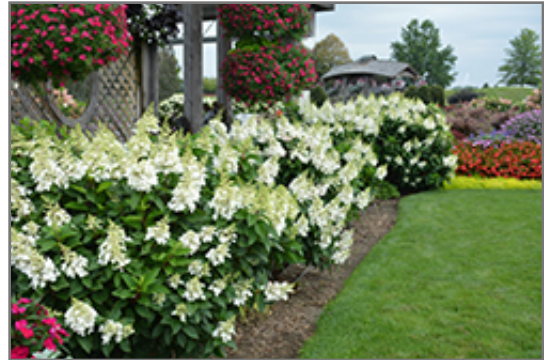
Fire Light Hydrangea in bloom

Fire Light Hydrangea will grow to be about 6 feet tall at maturity, with a spread of 6 feet. It tends to be a little leggy, with a typical clearance of 1 foot from the ground, and is suitable for planting under power lines. It grows at a medium rate, and under ideal conditions can be expected to live for 40 years or more.