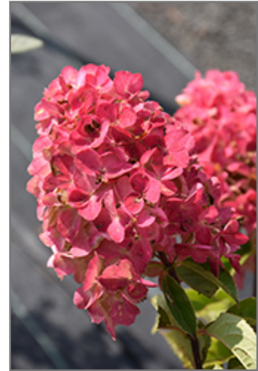
Fire Light Hydrangea flowers

Fire Light Hydrangea is recommended for the following landscape applications;