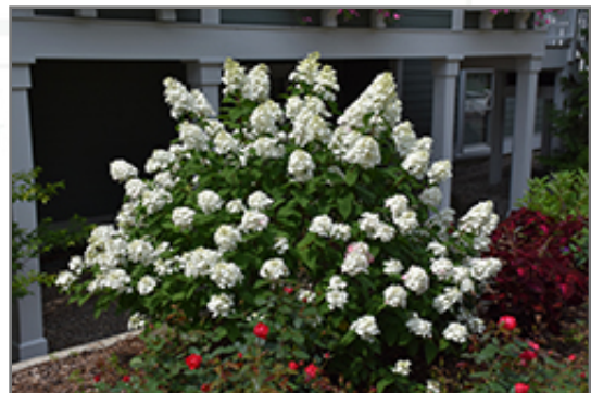
Fire Light Hydrangea in bloom