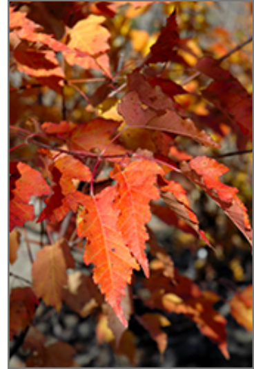
Ruby Slippers Amur Maple in fall

This tree does best in full sun to partial shade. It is very adaptable to both dry and moist locations, and should do just fine under average home landscape conditions. It is not particular as to soil type or pH. It is highly tolerant of urban pollution and will even thrive in inner city environments. This is a selected variety of a species not originally from North America.