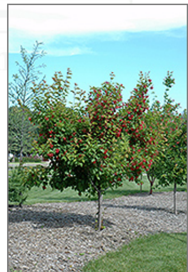
Ruby Slippers Amur Maple