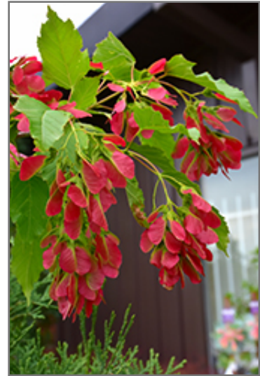
Ruby Slippers Amur Maple fruit