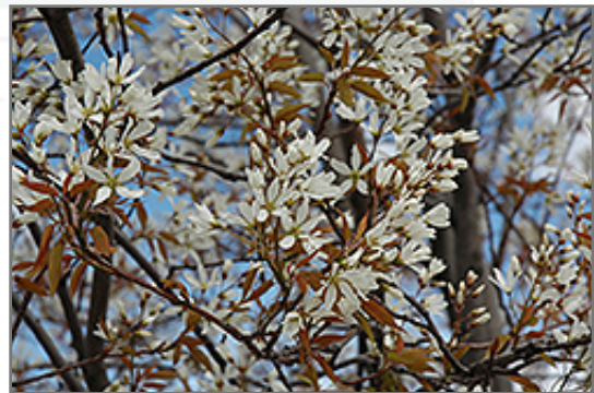
Autumn Brilliance Serviceberry flowers