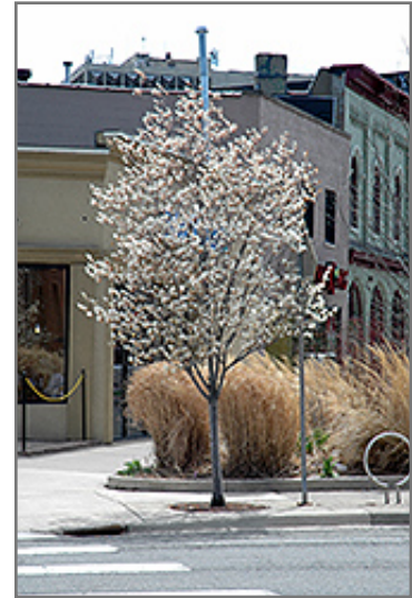
Autumn Brilliance Serviceberry in bloom

This is a relatively low maintenance tree, and is best pruned in late winter once the threat of extreme cold has passed. It is a good choice for attracting birds to your yard, but is not particularly attractive to deer who tend to leave it alone in favor of tastier treats. It has no significant negative characteristics.