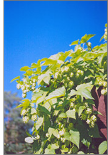
Hops fruit

Hops is a fine choice for the garden, but it is also a good selection for planting in outdoor pots and containers. Because of its spreading habit of growth, it is ideally suited for use as a 'spiller' in the 'spiller-thriller-filler' container combination; plant it near the edges where it can spill gracefully over the pot. It is even sizeable enough that it can be grown alone in a suitable container. Note that when growing plants in outdoor containers and baskets, they may require more frequent waterings than they would in the yard or garden. Be aware that in our climate, most plants cannot be expected to survive the winter if left in containers outdoors, and this plant is no exception. Contact our experts for more information on how to protect it over the winter months.