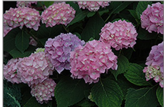
Endless Summer The Original Hydrangea flowers

Endless Summer The Original Hydrangea is a multi-stemmed deciduous shrub with a more or less rounded form. Its relatively coarse texture can be used to stand it apart from other landscape plants with finer foliage.