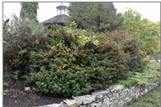
Blue Princess Meserve Holly fruit