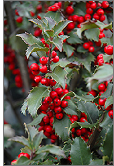
Blue Princess Meserve Holly fruit

Blue Princess Meserve Holly is recommended for the following landscape applications;