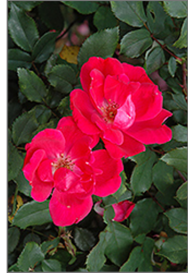
Red Knock Out Rose flowers

Red Knock Out Rose is recommended for the following landscape applications;