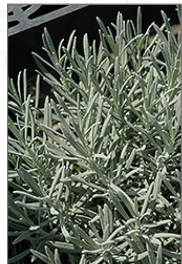
Phenomenal Lavender foliage