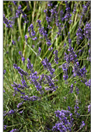
Phenomenal Lavender flowers

This is a relatively low maintenance shrub, and can be pruned at anytime. It is a good choice for attracting butterflies to your yard, but is not particularly attractive to deer who tend to leave it alone in favor of tastier treats. It has no significant negative characteristics.