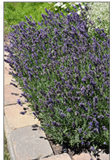
Ellagance Purple Lavender in bloom