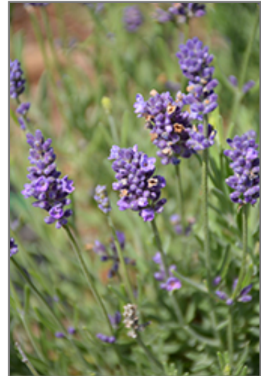
Ellagance Purple Lavender flowers

This is a relatively low maintenance shrub, and can be pruned at anytime. It is a good choice for attracting bees and butterflies to your yard, but is not particularly attractive to deer who tend to leave it alone in favor of tastier treats. It has no significant negative characteristics.