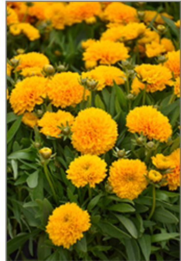
Solanna Golden Sphere Tickseed flowers

Solanna Golden Sphere Tickseed is a fine choice for the garden, but it is also a good selection for planting in outdoor pots and containers. It is often used as a 'filler' in the 'spiller-thriller-filler' container combination, providing a mass of flowers against which the thriller plants stand out. Note that when growing plants in outdoor containers and baskets, they may require more frequent waterings than they would in the yard or garden. Be aware that in our climate, most plants cannot be expected to survive the winter if left in containers outdoors, and this plant is no exception. Contact our experts for more information on how to protect it over the winter months.