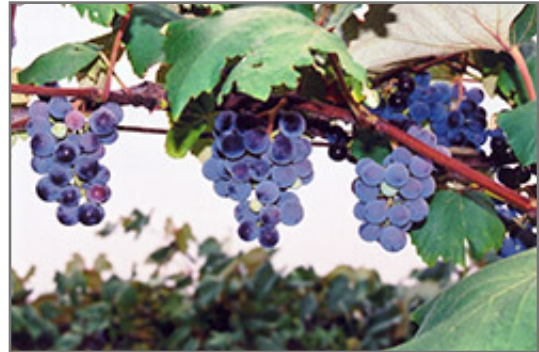
Concord Grape fruit

Concord Grape has rich green deciduous foliage on a plant with a spreading habit of growth. The lobed leaves turn yellow in fall. It produces abundant clusters of deep purple grapes with blue overtones from early to late fall.