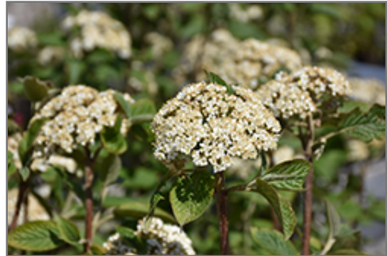
Mohican Viburnum flowers

Mohican Viburnum is a multi-stemmed deciduous shrub with a more or less rounded form. Its average texture blends into the landscape, but can be balanced by one or two finer or coarser trees or shrubs for an effective composition.