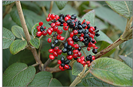
Mohican Viburnum fruit