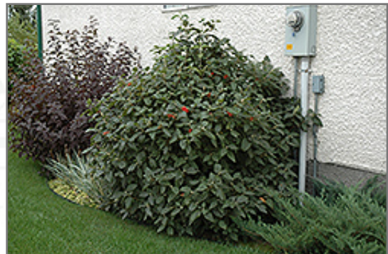
Mohican Viburnum