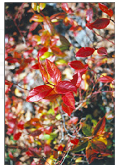
Northsky Blueberry in fall