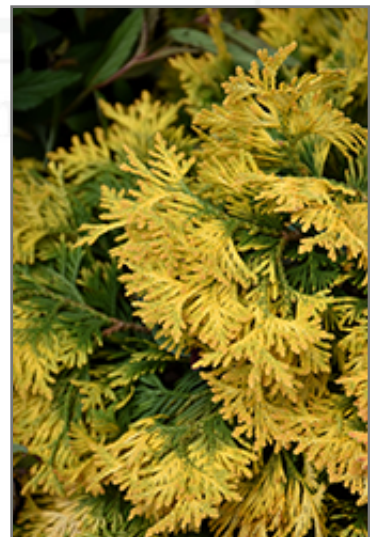
Sunkist Arborvitae foliage