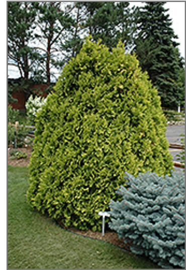
Sunkist Arborvitae

Sunkist Arborvitae is recommended for the following landscape applications;