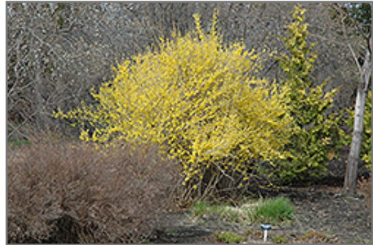
Northern Gold Forsythia in bloom

Northern Gold Forsythia is a multi-stemmed deciduous shrub with an upright spreading habit of growth. Its average texture blends into the landscape, but can be balanced by one or two finer or coarser trees or shrubs for an effective composition.