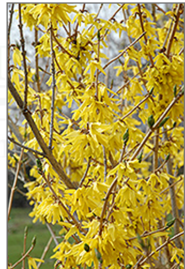
Northern Gold Forsythia flowers