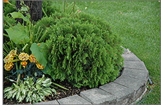
Danica Arborvitae