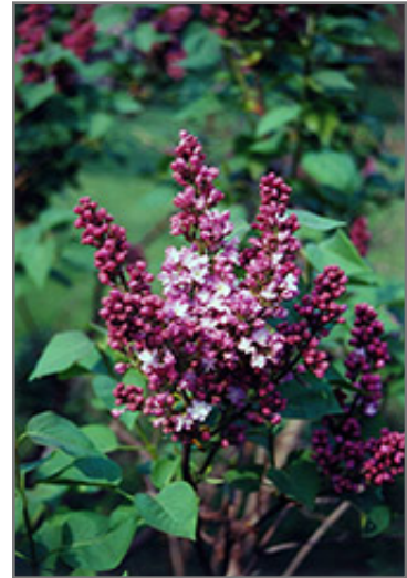
Belle de Nancy Lilac flowers