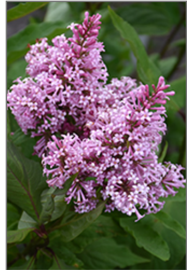
James MacFarlane Lilac flowers