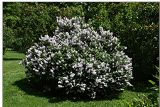
Miss Kim Lilac in bloom