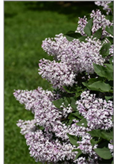
Miss Kim Lilac flowers

Miss Kim Lilac is recommended for the following landscape applications;