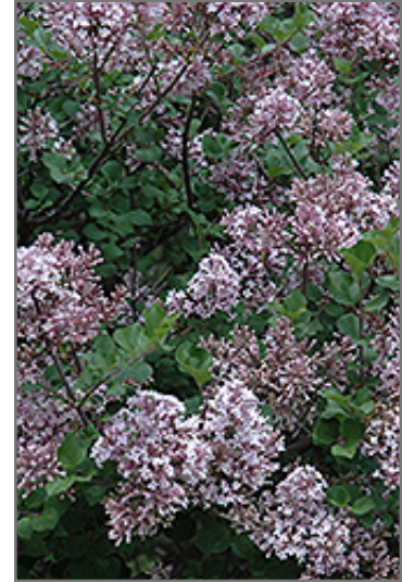
Dwarf Korean Lilac flowers

This is a relatively low maintenance shrub, and should only be pruned after flowering to avoid removing any of the current season's flowers. It is a good choice for attracting butterflies to your yard. It has no significant negative characteristics.