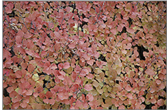
Dwarf Korean Lilac in fall

This shrub should only be grown in full sunlight. It is very adaptable to both dry and moist locations, and should do just fine under average home landscape conditions. It is not particular as to soil type or pH. It is highly tolerant of urban pollution and will even thrive in inner city environments. This is a selected variety of a species not originally from North America.