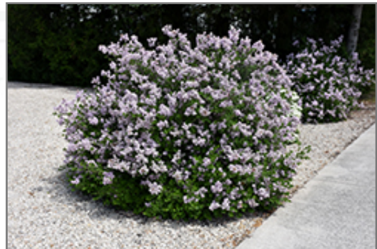
Dwarf Korean Lilac in bloom