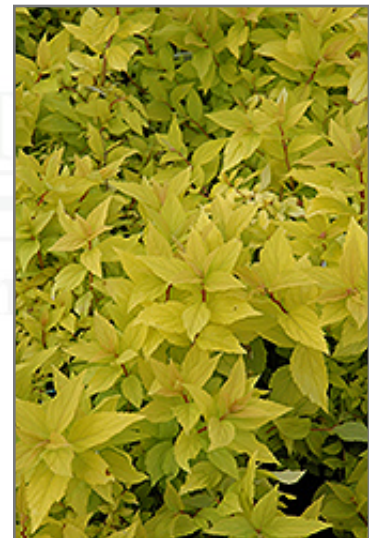
Goldmound Spirea foliage