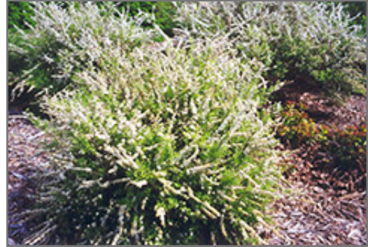
Dwarf Garland Spirea in bloom

Dwarf Garland Spirea will grow to be about 4 feet tall at maturity, with a spread of 3 feet. It tends to fill out right to the ground and therefore doesn't necessarily require facer plants in front. It grows at a fast rate, and under ideal conditions can be expected to live for approximately 20 years.