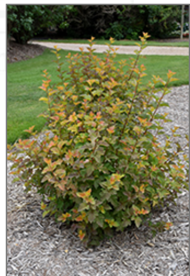
Amber Jubilee Ninebark