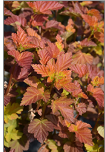
Amber Jubilee Ninebark foliage

Amber Jubilee Ninebark is a multi-stemmed deciduous shrub with an upright spreading habit of growth. Its average texture blends into the landscape, but can be balanced by one or two finer or coarser trees or shrubs for an effective composition.