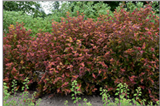
Amber Jubilee Ninebark

This shrub does best in full sun to partial shade. It is very adaptable to both dry and moist locations, and should do just fine under average home landscape conditions. It is not particular as to soil type or pH. It is highly tolerant of urban pollution and will even thrive in inner city environments. This is a selection of a native North American species.