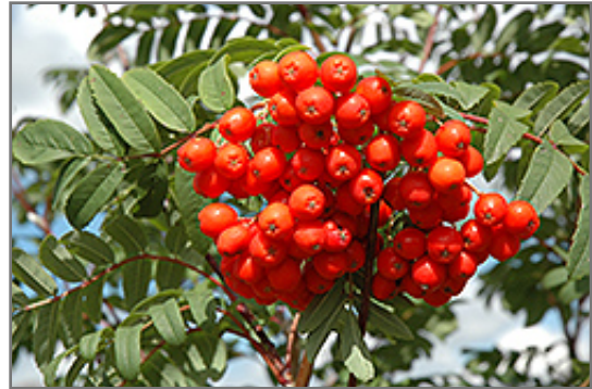
Cardinal Royal Mountain Ash fruit

Cardinal Royal Mountain Ash will grow to be about 30 feet tall at maturity, with a spread of 20 feet. It has a low canopy with a typical clearance of 4 feet from the ground, and should not be planted underneath power lines. It grows at a medium rate, and under ideal conditions can be expected to live for 50 years or more.