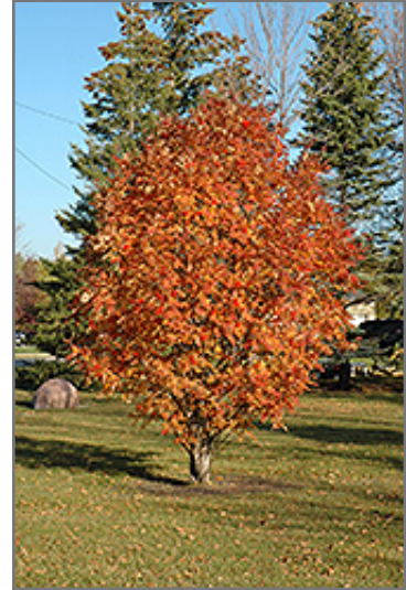
Cardinal Royal Mountain Ash in fall

This is a relatively low maintenance tree, and usually looks its best without pruning, although it will tolerate pruning. It is a good choice for attracting birds to your yard. Gardeners should be aware of the following characteristic(s) that may warrant special consideration;