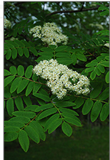
Cardinal Royal Mountain Ash flowers