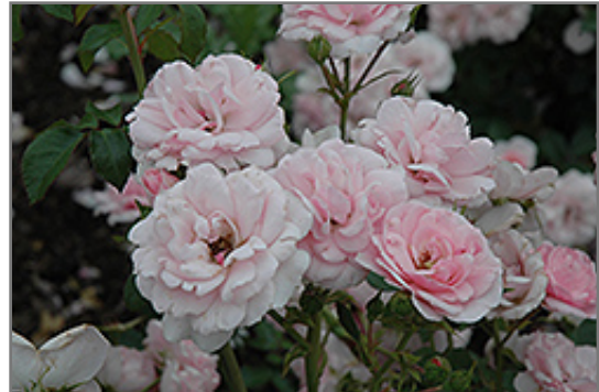
Bonica Rose flowers

This is a high maintenance shrub that will require regular care and upkeep, and is best pruned in late winter once the threat of extreme cold has passed. Gardeners should be aware of the following characteristic(s) that may warrant special consideration;