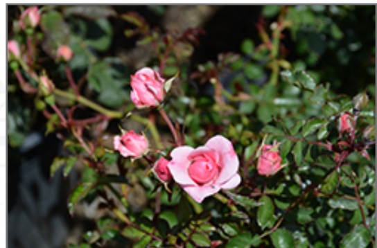
Bonica Rose flower buds