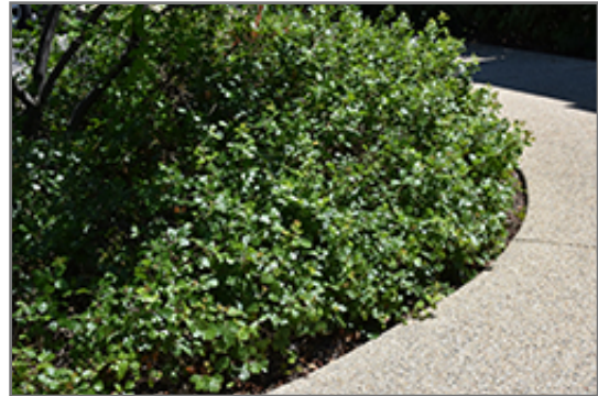
Gro-Low Fragrant Sumac