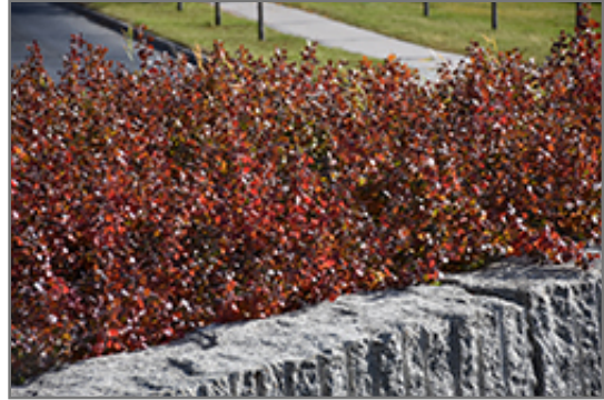
Gro-Low Fragrant Sumac in fall

Gro-Low Fragrant Sumac will grow to be about 24 inches tall at maturity, with a spread of 7 feet. It has a low canopy. It grows at a slow rate, and under ideal conditions can be expected to live for approximately 25 years.