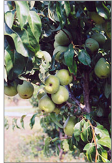
Anjou Pear fruit

Anjou Pear is bathed in stunning clusters of white flowers with purple anthers along the branches in early spring. It has forest green deciduous foliage. The glossy pointy leaves turn an outstanding deep purple in the fall. The fruits are showy green pears with a red blush, which are carried in abundance in early fall. The fruit can be messy if allowed to drop on the lawn or walkways, and may require occasional clean-up.