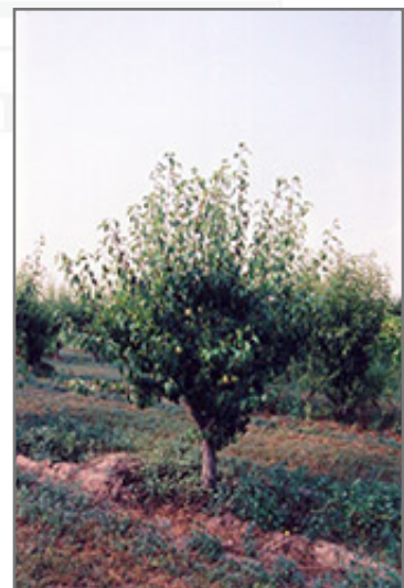
Anjou Pear