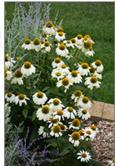
PowWow White Coneflower in bloom