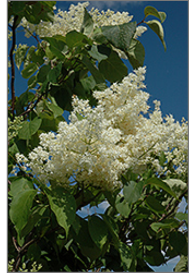
Ivory Silk Tree Lilac (tree form) flowers