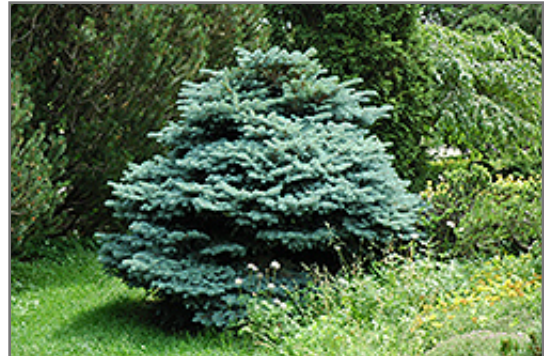
Globe Blue Spruce