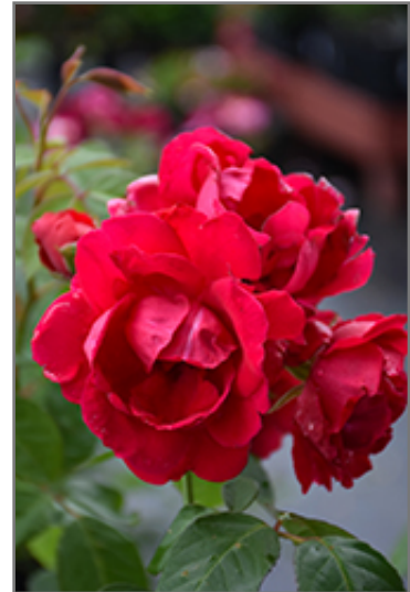
Blaze Rose flowers