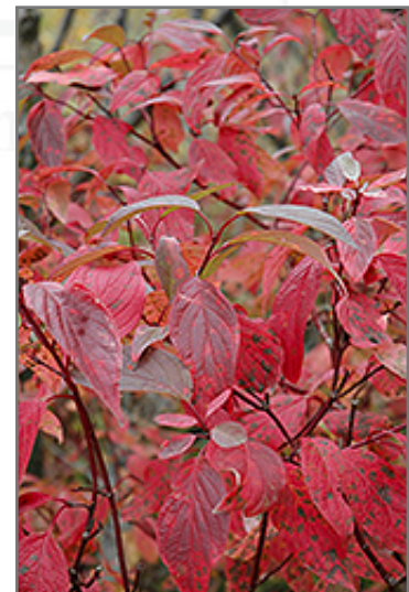
Red Osier Dogwood in fall