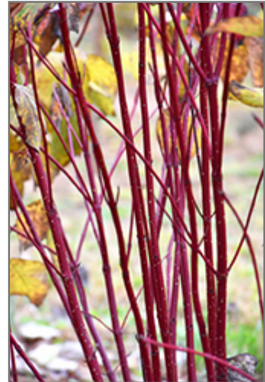
Red Osier Dogwood stems

This shrub will require occasional maintenance and upkeep, and can be pruned at anytime. It is a good choice for attracting birds to your yard. Gardeners should be aware of the following characteristic(s) that may warrant special consideration;