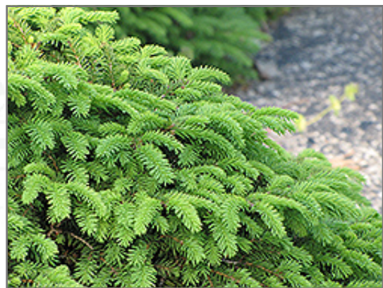
Birds Nest Spruce foliage