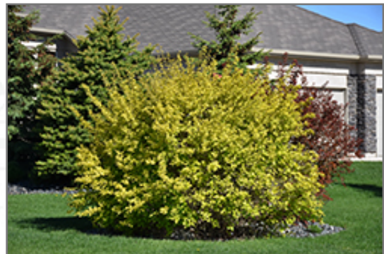
Dart's Gold Ninebark