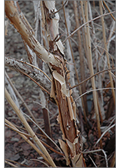
Dart's Gold Ninebark bark

This shrub does best in full sun to partial shade. It is very adaptable to both dry and moist locations, and should do just fine under average home landscape conditions. It is not particular as to soil type or pH. It is highly tolerant of urban pollution and will even thrive in inner city environments. This is a selection of a native North American species.