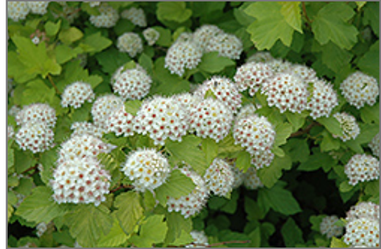
Dart's Gold Ninebark flowers

Dart's Gold Ninebark is a multi-stemmed deciduous shrub with a more or less rounded form. Its average texture blends into the landscape, but can be balanced by one or two finer or coarser trees or shrubs for an effective composition.