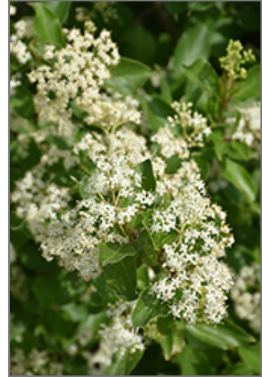
Gray Dogwood flowers

This shrub performs well in both full sun and full shade. It is an amazingly adaptable plant, tolerating both dry conditions and even some standing water. It is not particular as to soil type or pH. It is highly tolerant of urban pollution and will even thrive in inner city environments. Consider applying a thick mulch around the root zone in winter to protect it in exposed locations or colder microclimates. This species is native to parts of North America.