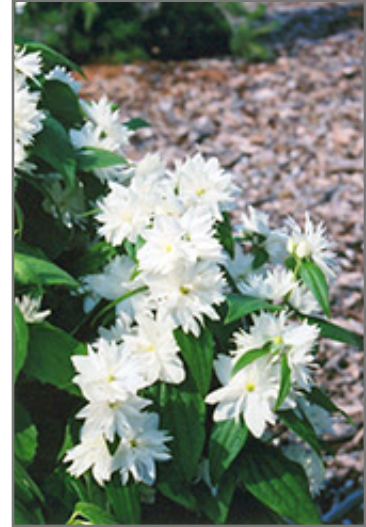
Minnesota Snowflake Mockorange flowers