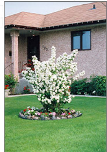
Minnesota Snowflake Mockorange in bloom