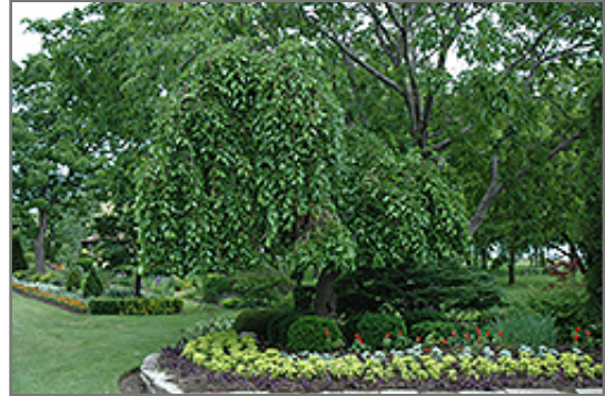
Weeping Mulberry