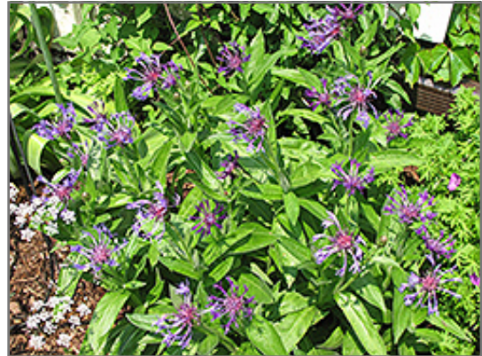
Blue Cornflower in bloom

Blue Cornflower is an herbaceous perennial with an upright spreading habit of growth. Its medium texture blends into the garden, but can always be balanced by a couple of finer or coarser plants for an effective composition.