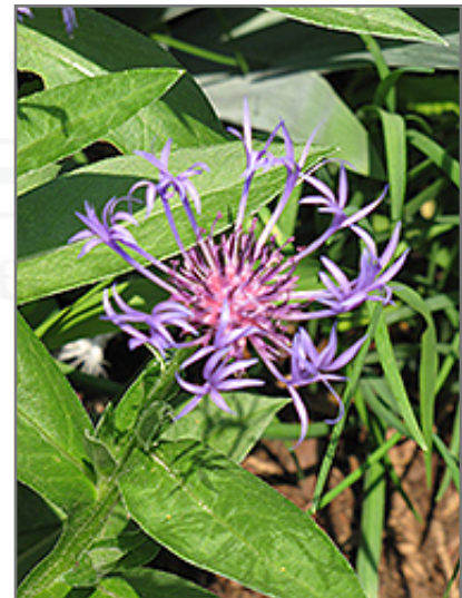
Blue Cornflower flowers