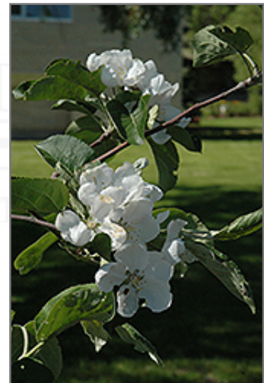
Macintosh Apple flowers