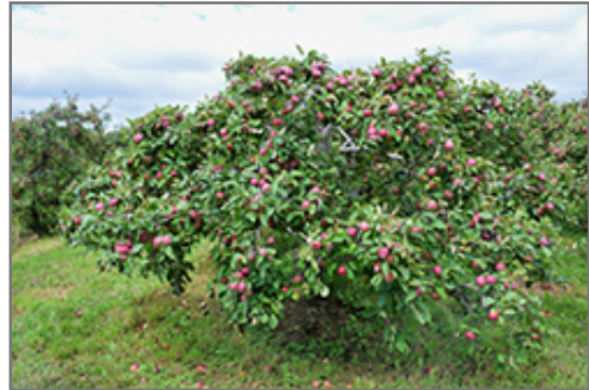
Macintosh Apple fruit

Macintosh Apple features showy clusters of lightly-scented white flowers with shell pink overtones along the branches in mid spring, which emerge from distinctive pink flower buds. It has forest green deciduous foliage. The pointy leaves turn yellow in fall. The fruits are showy red apples with hints of light green, which are carried in abundance in early fall. The fruit can be messy if allowed to drop on the lawn or walkways, and may require occasional clean-up.