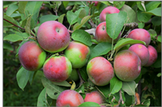
Macintosh Apple fruit