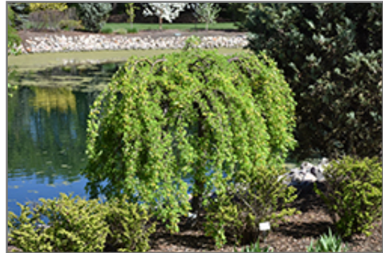
Weeping Peashrub

Weeping Peashrub is recommended for the following landscape applications;