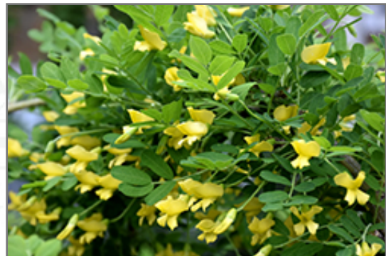
Weeping Peashrub flowers