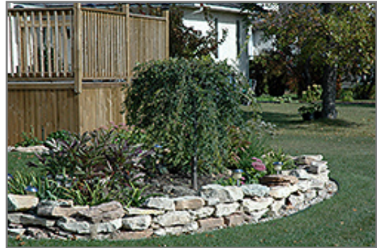
Weeping Peashrub

This shrub does best in full sun to partial shade. It prefers dry to average moisture levels with very well-drained soil, and will often die in standing water. It is considered to be drought-tolerant, and thus makes an ideal choice for xeriscaping or the moisture-conserving landscape. It is not particular as to soil type or pH, and is able to handle environmental salt. It is highly tolerant of urban pollution and will even thrive in inner city environments. This is a selected variety of a species not originally from North America.