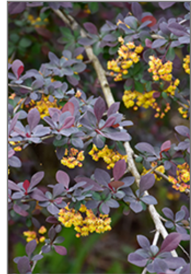
Royal Cloak Japanese Barberry flowers

This shrub should only be grown in full sunlight. It does best in average to evenly moist conditions, but will not tolerate standing water. It is not particular as to soil type or pH. It is highly tolerant of urban pollution and will even thrive in inner city environments. This is a selected variety of a species not originally from North America.