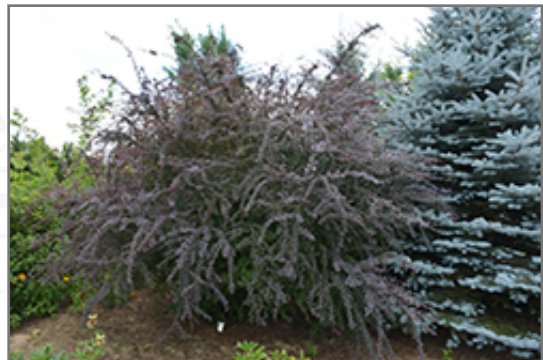
Royal Cloak Japanese Barberry