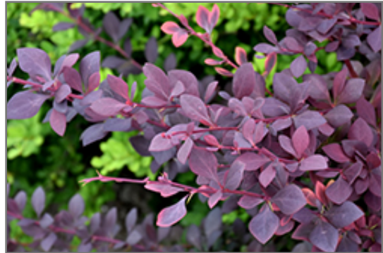
Royal Cloak Japanese Barberry foliage