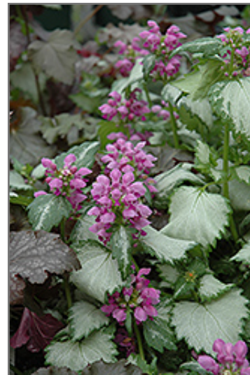
Ghost Spotted Dead Nettle flowers