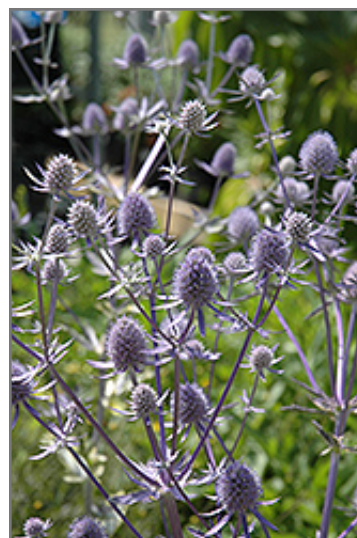
Jade Frost Variegated Sea Holly flowers

Jade Frost Variegated Sea Holly is recommended for the following landscape applications;